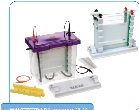
WAVETETRAD1 , see pages 38-39