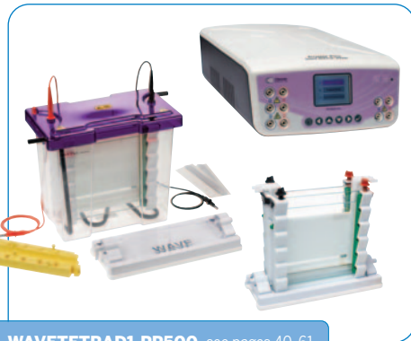
WAVETETRAD1-PP500 , see pages 40, 61