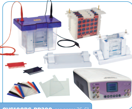
CVS10CBS-PP300 , see pages 36, 61