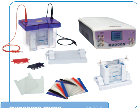
CVS10DSYS-PP300 , see pages 34-35, 61